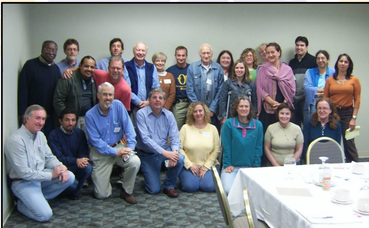
Attendees of the first International Street Medicine Symposium, Pittsburgh, 2005

This year, we gather as a street medicine community for the 20 th time. Thank you for joining us in Kansas City for this milestone symposium. The vision is more important than ever. The heartbeat is stronger than ever. May we all have a fantastic experience, and may we be worthy of those we serve.